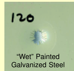
“Wet” Painted Galvanized Steel

Impact Test: The photos above show the effect of impact on Cold Rolled Steel with powder coat paint (left), and liquid paint over EG steel (right). This test shows how well the finish flexes and adheres to the steel with a standard 120 inch-pound force. Note that the liquid paint finish on EG steel has failed to adhere to the metal (shown actual size).